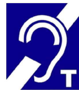
HEARING LOOP INSTALLED Switch hearing aid to T-coil

Induction loop systems are used worldwide and are required to meet the established international standard IEC 60118-4 as developed under the auspices of the IEC (International Electrotechnical Commission). This standard defines the strength of the magnetic field, frequency response and methods of measuring these requirements. It also specifies the maximum levels for electromagnetic background noise. Compliance with the standard will be the result of correct equipment specification, wiring loop design and installation and requires verification.