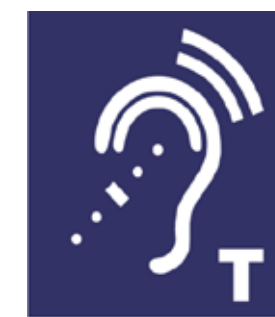
HEARING LOOP INSTALLED Switch hearing aid to T-coil