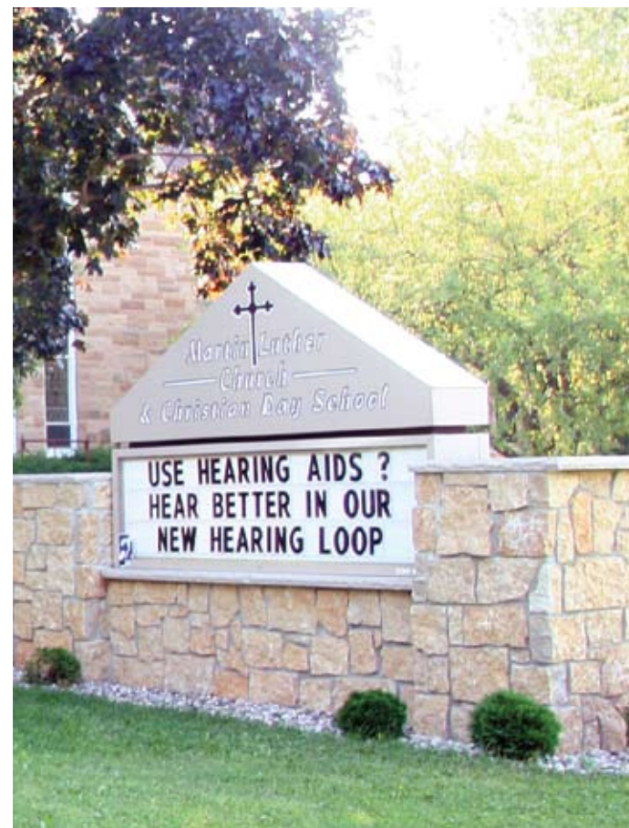
Martin Luther Evangelical Lutheran Church, Oshkosh, WI

This simple technology, which also enables a home TV to broadcast through one's hearing aids, is now being advocated by a growing number of hearing leaders. In 2010, the Hearing Loss Association of America ("the nation's voice for people with hearing loss") and the American Academy of Audiology (the world's largest association of hearing professionals) announced a joint "collaborative public education campaign 'Get in the Hearing Loop.'" The campaign aims "to enlighten and excite hearing aid users, as well as audiologists and other professionals who dispense hearing aids, about telecoils and hearing loops and their unique benefits." Hearing loops are coming to America.